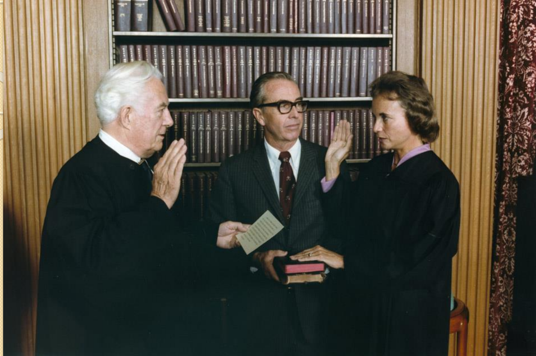
Justice O'Connor sworn in by C. J. Warren Burger in 1981