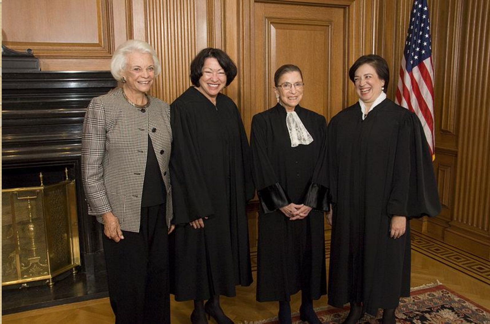
Justices O' Connor, Sonia Sotomayor, Ruth Bader Ginsburg, and Elena Kagan