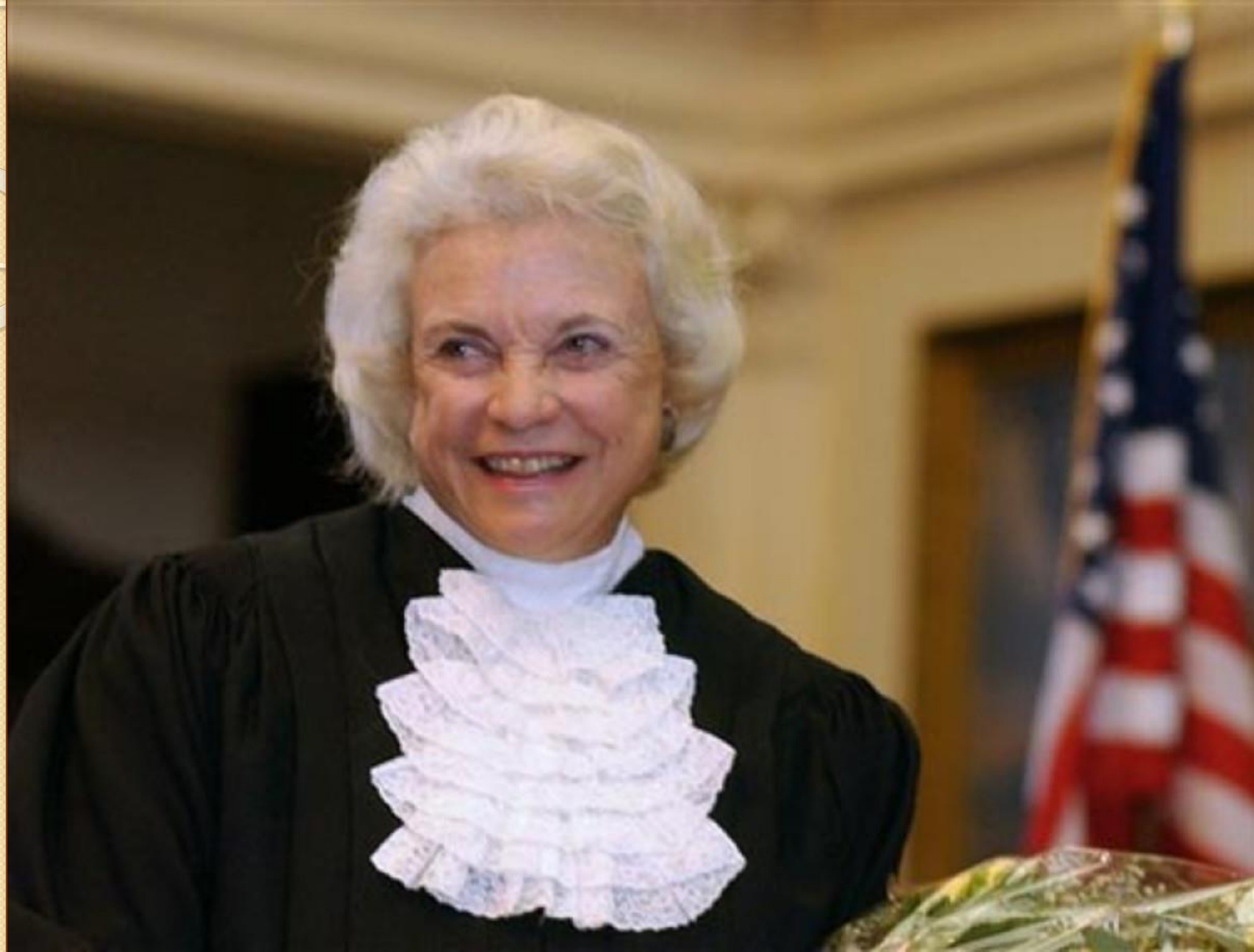
Justice Sandra Day O'Connor