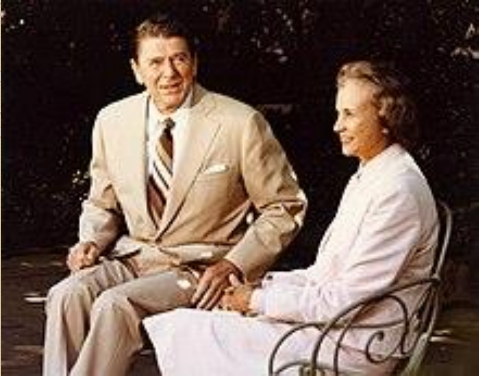
President Ronald Reagan and Sandra Day O'Connor